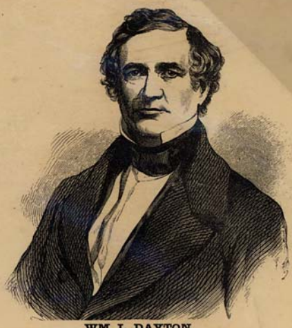
WM. L. DAYTON.

Aug 9. 1856 WALDO'S THE UNITED STATES, TO EXHIBIT THE FREE AND SLAVE STATES, FORMED BY THE REPEAL OF THE MISSOURI COMPROMISE. FREE AND SLAVE STATES, FROM THE CENSUS OF 1850.