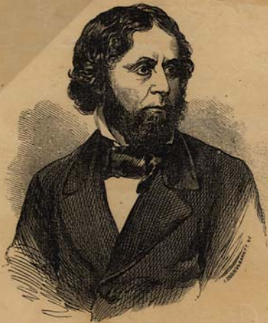
JOHN C. FREMONT.